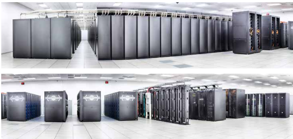
A panoramic view of the Blue Waters complex including Sonexion units and networking hardware. Top image is merely the left half of the panorama shot, and the bottom image is the right half.

The active archive enables NCSA to keep all of its nearline data accessible in an active repository and provides users online access to all data while also reducing the complexity and cost normally associated with very large datasets. It no longer has to duplicate tape to another system because of Redundant Array of Independent Tape (RAIT) software and therefore the total cost of ownership is much lower than it was before.